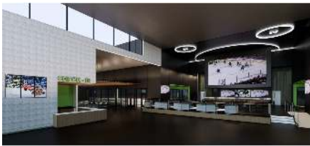
Fan lobby and check in, JLG Architects.

The renderings here come directly from JLG Architects. They show the fan lobby, the main arena bowl, and the dedicated practice rink that will define the Ice Cove experience. Below them, a photo taken on site in May 2026 shows where the project stands today, the work is real and underway.