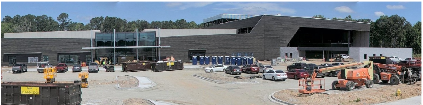
Anchor Park under construction, May 2026.