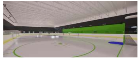
Dedicated practice rink, JLG Architects.